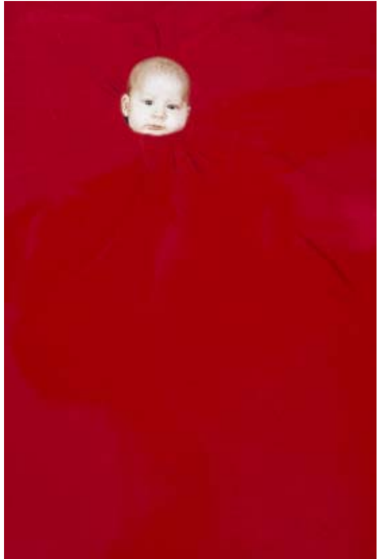
Kim Yasuda, detail from The Canyon That Took the Place of a Couch , 1999. Mixed media installation (foam, fabric, plastic, porcelain, cast plaster, resin, video projection), 12 x 18 x 30 ft. Art in General, New York.

Social interventionist artists or, artists making social sculpture, like those mentioned above, create projects designed to initiate fundamental and concrete urban, social, and/or environmental change through social interactions that draw laypeople, the media, and/or government officials into the process. They take aim at specific governmental policies and social and ecological practices by targeting the source of the problem, often in dramatic and highly visible ways. More-