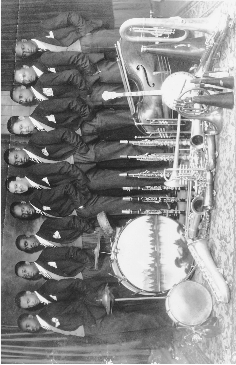
Figure 12 The Ten Pals, dressed to the nines.