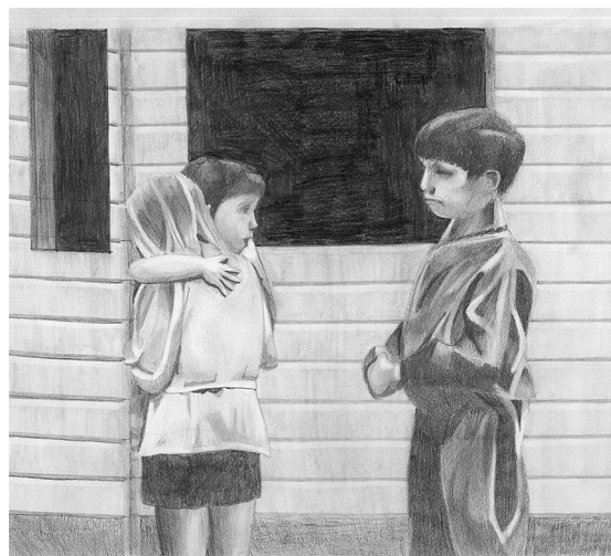
FIGURE 3.2. An example of a peaceful post-conflict reunion between two former opponents after a brief conflict-induced separation. The boy is an interested bystander and did not mediate the reunion between the two preschool girls. Illustration by Eric P. Snowden from video observations by Peter Verbeek.

In a subsequent study, Verbeek (1997) demonstrated that remaining together following conflict is more common among friends (and acquaintances) than among nonfriends—partly because friends are more likely to be interacting prior to the conflict and partly because they use conciliatory strategies more readily. A second conflict outcome was examined, post-conflict reunions , that is, coming together in a peaceful manner in a post-conflict observation (Fig. 3.2). These reunions, which generally occurred within the first four minutes after a conflict-induced separation, did not differ according to the friendship relations existing between the children (cf. Butovskaya et al., Chapter 12). Friendship, then, seems to promote management strategies among young