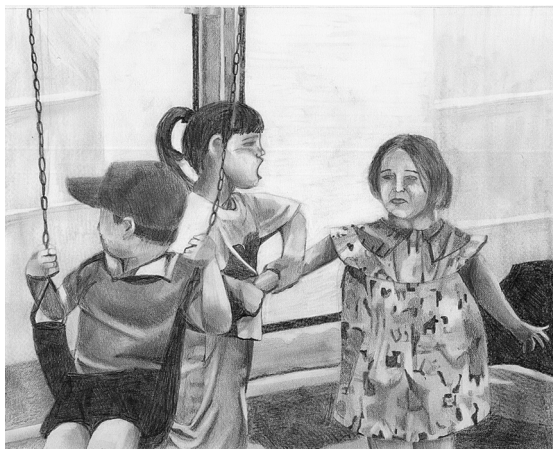
FIGURE 3.1. An example of a conflict in the social domain. Two preschool girls use physical assertion to terminate a dispute over taking turns in pushing a boy on a swing. Illustration by Eric P. Snowden from video observations by Peter Verbeek.

to resume the mutually rewarding interaction. Conversely, two children may share a long-term investment in an established relationship and may reconcile their differences in order to preserve the integrity of their relationship (see de Waal, Chapter 2; Cords & Aureli, Chapter 9; and van Schaik & Aureli, Chapter 15, for similar concepts in non-human animals).