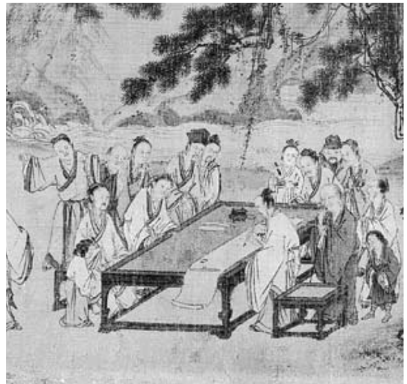
FIGURE 1.12 Attributed to Ma Yuan (active before 1189—after 1225). Composing Poetry on a Spring Outing . Southern Song dynasty. Detail of a handscroll. Ink and color on silk. Height 29.3 cm, length 302.3 cm. The Nelson-Atkins Museum of Art, Kansas City, Missouri. (Purchase: Nelson Trust.)