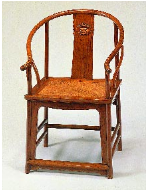
FIGURE 1.11 Roundback chair. Ming or Qing dynasty, seventeenth century. Huanghuali wood with boxwood inlay. Height 100 cm, width 59 cm, depth 46 cm. © Christie's Images, Ltd., 1999.