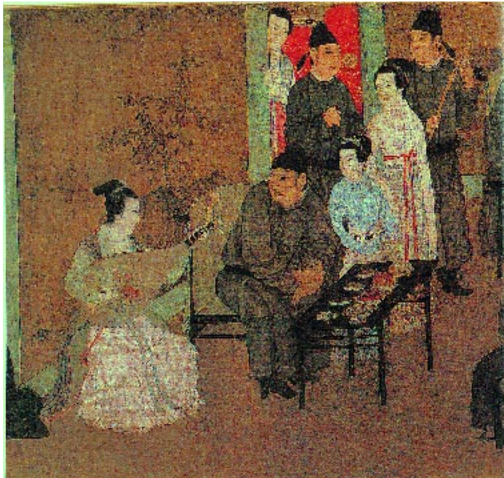
FIGURE 1.8 Attributed to Gu Hongzhong (tenth century). The Night Revels of Han Xizai . Early twelfth-century copy. Detail of a handscroll. Ink and color on silk. Height 29 cm, length 338.3 cm. Palace Museum, Beijing.

story behind its creation were recorded in the early-twelfth-century catalog of the painting collection of the Song emperor Huizong (r. 1101–26). 16 Han Xizai was an accomplished and learned gentleman who, to avoid being appointed to an official government post, deliberately led a dissipated existence. The emperor was suspicious, however, and wanted to discover if there was any truth in the stories about Han's lavish and licentious parties. So he sent Gu Hongzhong to attend one of the banquets and paint what he saw, and what Gu saw was most improper according to Confucian standards. The result was not only this delightful painting, but also one of the first extant depictions of a Chinese interior showing in detail the chair-level