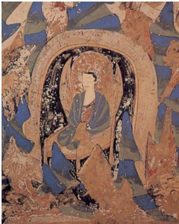
FIGURE 1.6 Detail of a wall painting in Dunhuang cave 285. Western Wei (535–557), dated to 538. From Dunhuang Wenwu Yanjiu, Zhongguo shiku Dunhuang Moyao ku , vol. 1, pl. 146.