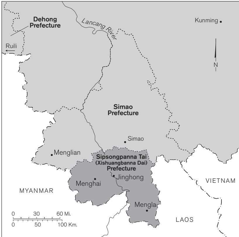
Map 2. Southern Yunnan and Sipsongpanna Tai (Xishuangbanna Dai) Autonomous Prefecture

traineeship in Buddhism. With their chants we rose to greet the day. Over the next three days, our delegation traveled down roads that roamed between rubber trees and rice paddies through the tropical jungle. Greeting the wide expanse of the river, we followed the sounds of water flowing into the black night, where we heard crickets and saw twinkling stars in the sky.