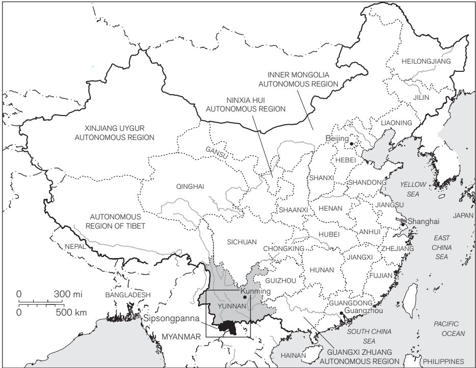
Map 1. People's Republic of China, 2005 (for detail, see map 2)

infants and tied at the two ends. Before arriving, we would travel by train, airplane, bus, and minivan to reach our destination of Xishuangbanna, the former Tai tributary kingdom of Sipsongpanna in Southwest China [see map 1]. 11 I was part of a delegation of American and Chinese English teachers, colleagues from the Ministry of Mining and Metallurgy, departing for vacation following the end of our annual meeting. On a packed-dirt road in front of the state-run Xishuangbanna Hotel, known as the Banna Bingguan, sat a corner shop with one small bare lightbulb hanging down on an electric wire. The proprietor laughed when we asked, “Where is the Mekong?” He knew only the local name, the Lancang River. In the early morning hours in the town of Jinghong, the former Tai kingdom capital of Tsen Hung, we watched smoke rise from small cook fires at the local Buddhist temple. Young Tai boys performed their morning rituals dressed in the long saffron robes that mark their