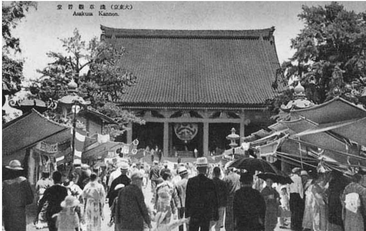
Visitors to the Sensō Temple in the 1920s.