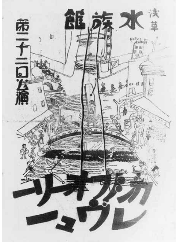
Poster for the Casino Folies revue, June 9, 1930.

low New Perceptionist, Yokomitsu Riichi. Indeed, Kawabata stated that Shanghai was the “grand summation of the methods” of the New Perceptionist School. 20 And he had early had some knowledge of the aims of modernism. Marinetti’s 1909 Declaration of the Futurists had been translated by prominent literary figure (and Japan’s surgeon general) Mori Ogai and published in Japan the same year it came out in Italy.