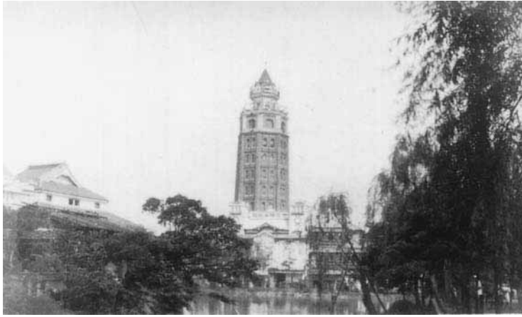
The Twelve Story Tower. Built in 1890, the tower was Tokyo's tallest building. It was destroyed in the 1923 Great Kanto Earthquake. This photo was taken sometime between 1910 and 1923.

old Kawabata, though nominally a Tokyo Imperial University student, rented his own place in Asakusa, on the second floor of a hat repair shop, and started to write.