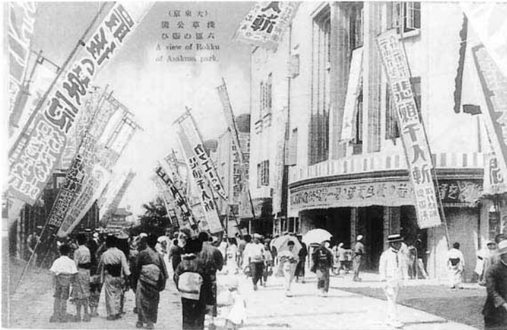
The Rokku, the cinema and theater district of Asakusa Park, in the late 1920s.