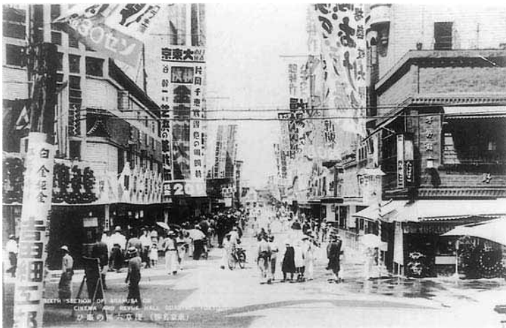
The Rokku and its cinemas and revue halls, 1933.