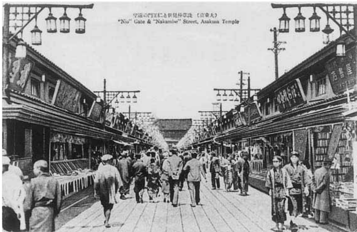
The Nakamise and the Nio Gate, 1924.