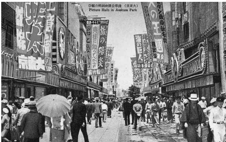
Movie theaters in the Rokku in the second half of the 1920s.