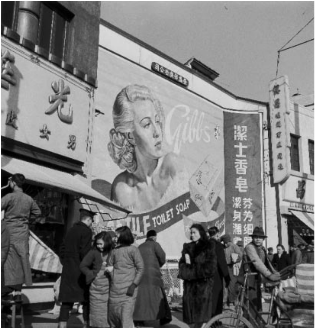
A woman in a fur coat passes a billboard image of Hollywood star Lana Turner. Shanghai, January 1948.