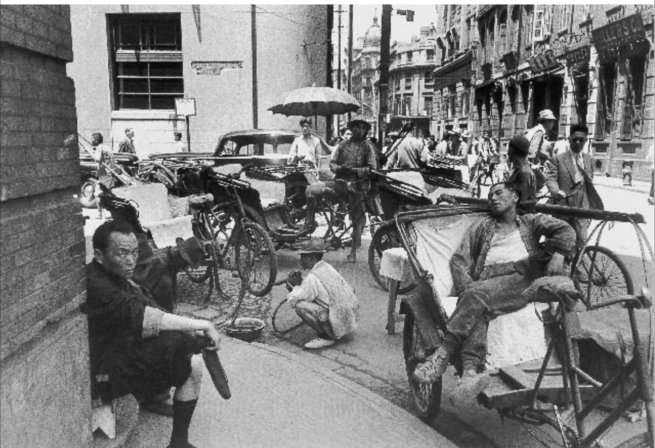
A sleeping pedicab driver waits for his passenger's return. Shanghai, May 1948.