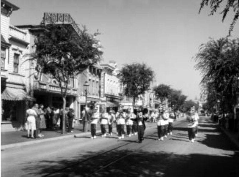
Disneyland's Main Street USA soon after opening, July 1955.