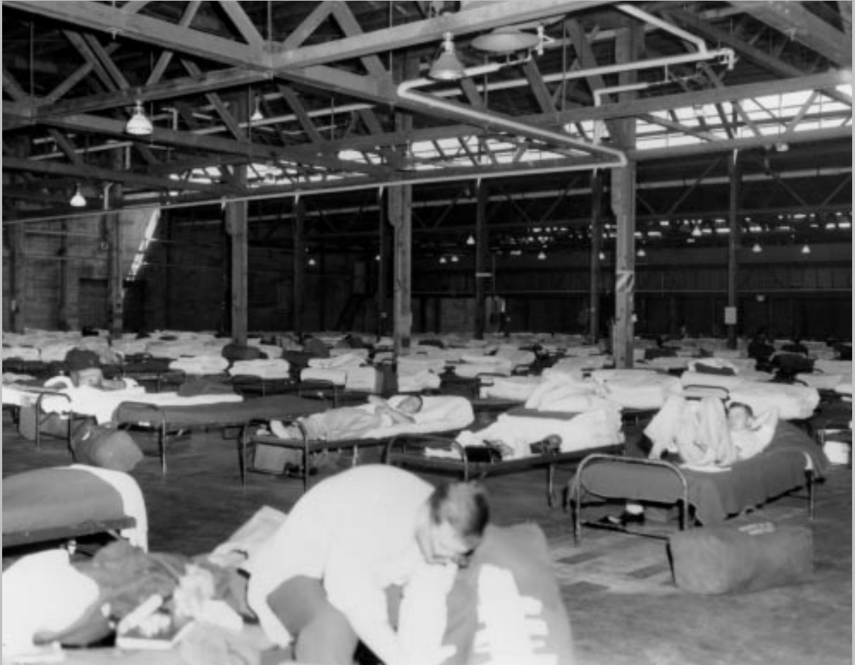
Building 590 at the Oakland Army Base filled with cots used for overnight billeting by soldiers on their way to Vietnam, 1967. This is the building that now houses the museum's collection storage.