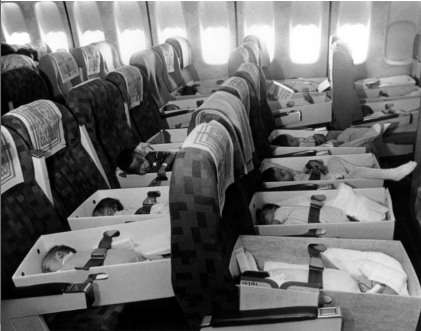
Interior of a World Airways plane during one of their flights for Operation Babylift, April 1975. For safety, the smaller children and infants were strapped into cardboard boxes donated by a local Oakland stationery store.

OAKLAND TRIBUNE COLLECTION, GIFT OF ANG NEWSPAPERS OAKLAND MUSEUM OF CALIFORNIA