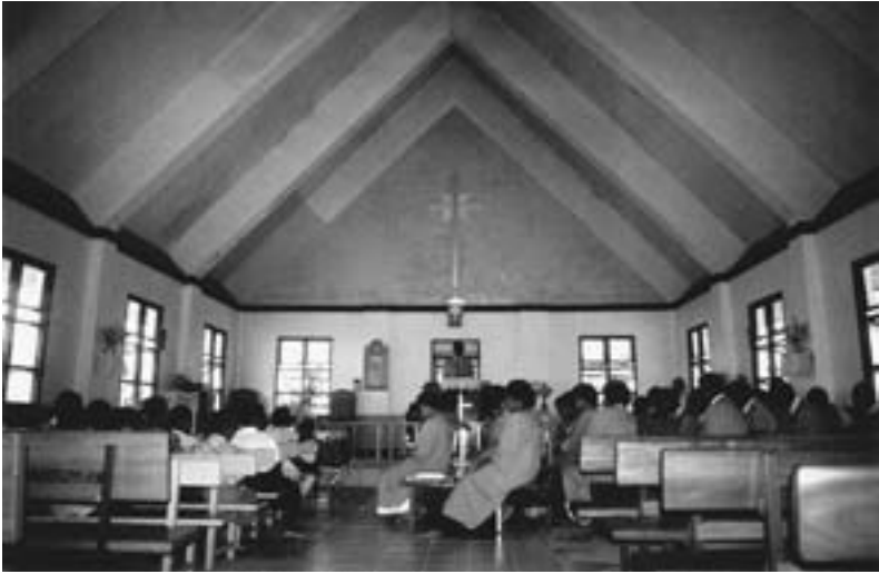
FIGURE 2. Inside the Tavuki church.

night and take boats out to pursue bigger fish in deeper waters. Kadavu is well known internationally as a dive site because of the Astrolabe Reef, and the eastern half of the island has numerous small scuba-diving resorts, but the impact of these resorts is negligible in Tavuki and tourists are very rarely seen in the village. Many Tavukians spend time on Vitilevu for education or work, but, like many Fijians, at Christmastime they return to their true homes “on the foundation” ( dela ni yavu ), streaming back to the village for weeks of celebration.