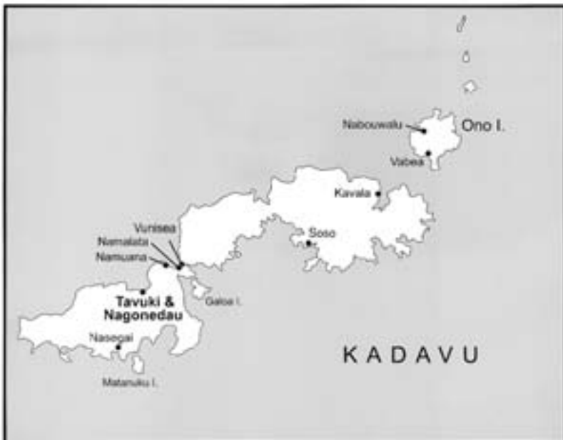
MAP 2. Kadavu

to come and help in the war against Nabukelevu and Yawe and added, “If after the war they want to prepare gifts for you tell them to make me Lord of Tavuki, and that you will go home.” He went back to Tavuki but told no one. On the appointed day the men of Naceva came. The people of Tavuki were angry with the Nephew-to-Naceva. “Why did you not tell us? They have come here and are hungry and there is no food for them. If you had told us we might have made a feast to await them with.” . . . The Lord of Tavuki ordered sugar cane and plenty of food. Then they went out to battle and defeated the enemy. When the army returned the people of Tavuki told the men of Naceva, “Wait till we have prepared a small thing for you.” The men of Naceva answered, “All we desire [is that] you should make our nephew Lord of Tavuki. . . .” So the Nephew-to-Naceva was made Lord of Tavuki and from him are descended the present chiefs.