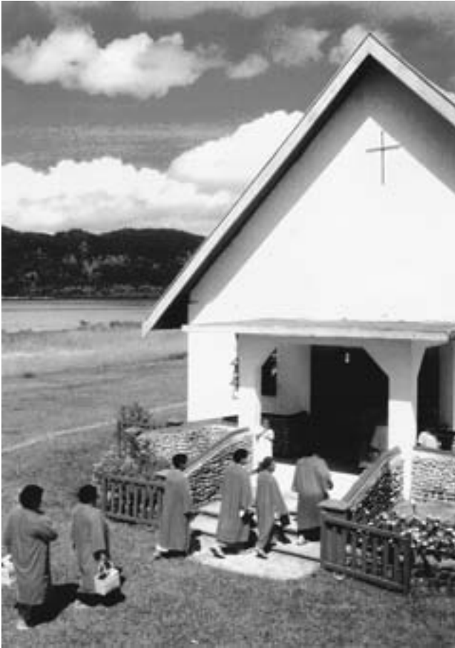
FIGURE 1. The choir enters the Tavuki Methodist church before a Sunday service.

Islands Bureau of Statistics 1998: 30–31) and over 93 percent of whom were members of the Methodist Church (Government of Fiji 1995). It is a rural island, ranking eleventh out of Fiji's fifteen provinces in population density, at twenty people per square kilometer (Rakaseta 1999: 6).