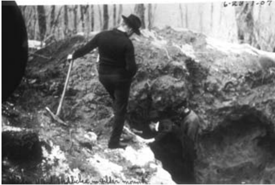
FIGURE 2.2 Aleš Hrdlička examining the stratigraphy in the Gilder Mound, Nebraska, January 1907.

July of 1897, then met to confront each other at the AAAS meetings that August. Once more, their positions were irreconcilable. But this time the BAAS was meeting jointly with the AAAS, and Sir John Evans himself, the Dean of the European Paleolithic, was there. At the meetings he was shown a set of the Trenton paleoliths but dismissed them as Neolithic, not Paleolithic (McGee 1897). It was a devastating blow.