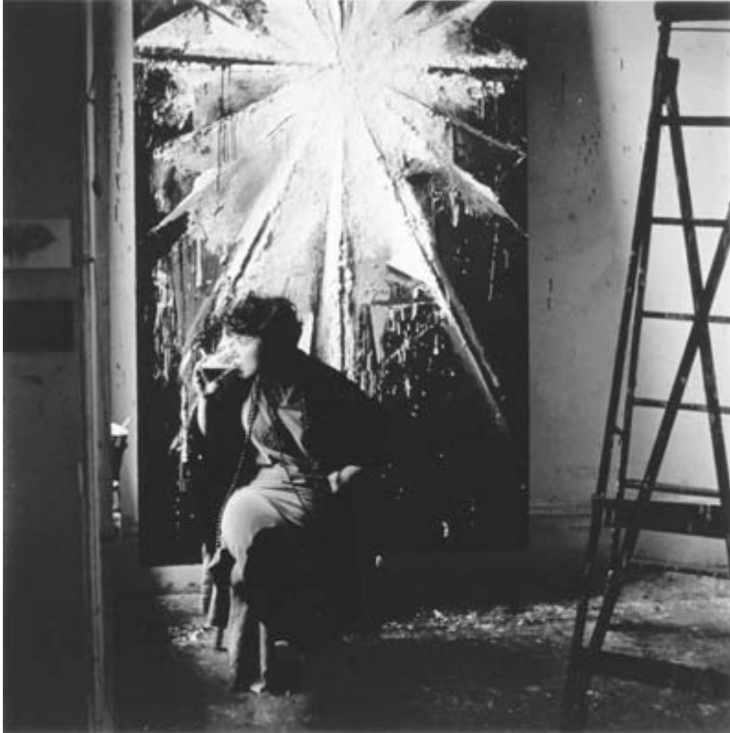
Jay DeFeo in front of The Jewel in her studio, before its completion, c. 1958–59.