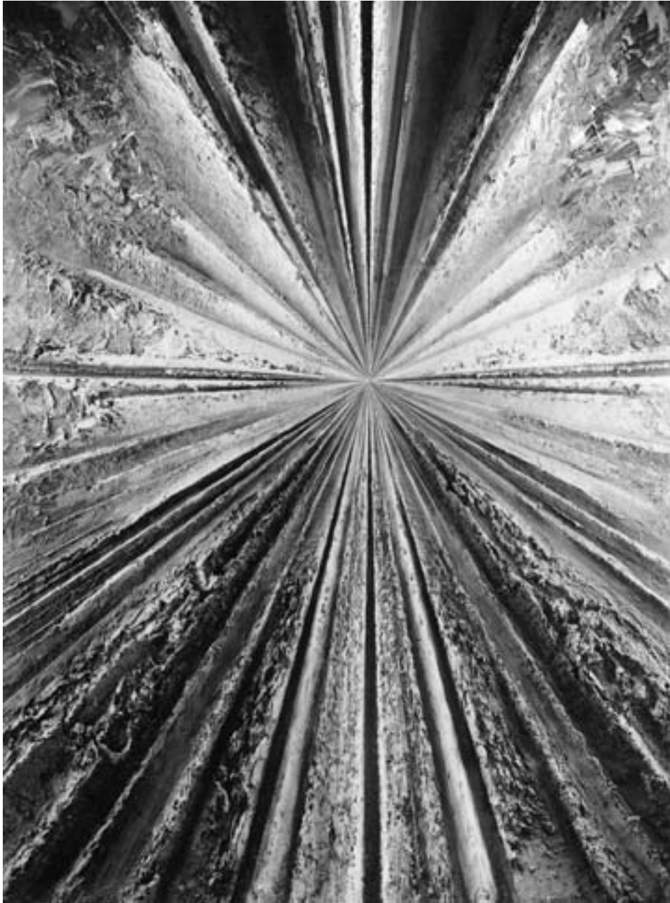
Jay DeFeo, Deathrose (early version of The Rose ), oil on canvas, 1958–59, 110½ x 81½ inches.