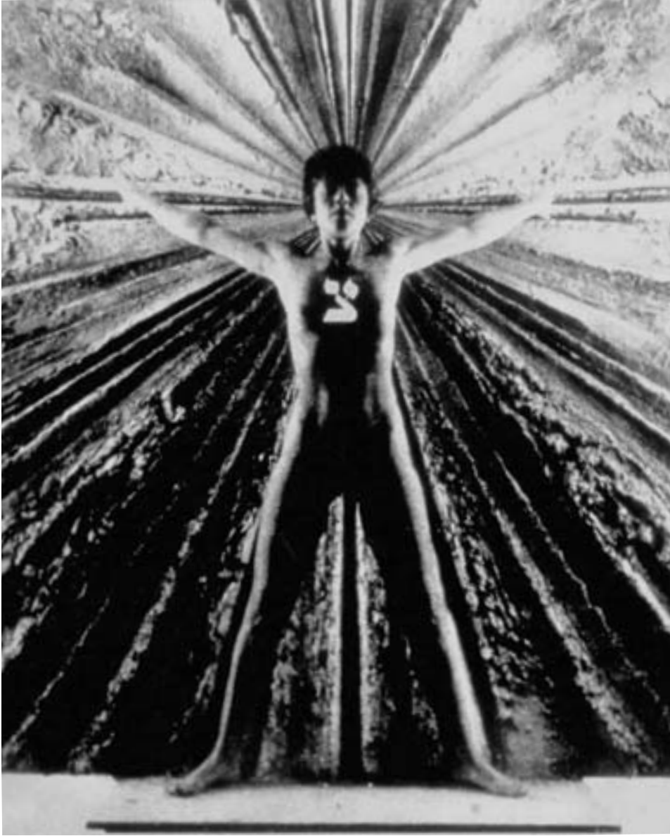
Wallace Berman, Portrait of Jay DeFeo , 1959. Toned gelatin-silver print with collage, 9 x 7½ inches. Whitney Museum of American Art, New York. Gift of the Lannan Foundation. (Although signed and dated 1958, it is believed this photograph was taken in 1959.)